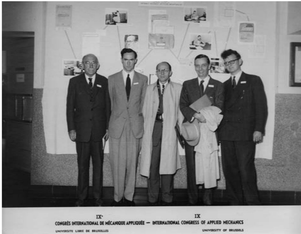
Figure 8.5 George Batchelor (second from left) at the IXth International Congress of Applied Mechanics in Brussels, 1956; James Lighthill on the right.

to 1978, but was content throughout that period to leave the running of the department to Batchelor, who was Head of the Department from its foundation in 1959 until his retirement in 1983.