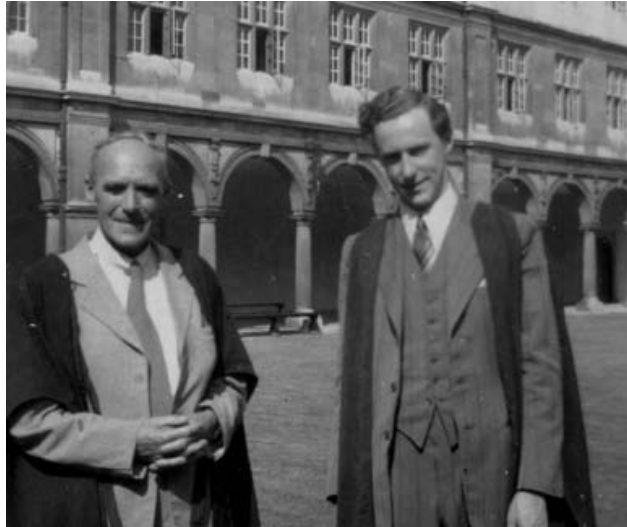
Figure 8.2 George Batchelor with his mentor Sir Geoffrey (G.I.) Taylor, PhD graduation day, 1948.

had left Cambridge to take the Chair of Applied Mathematics at the University of Bristol.