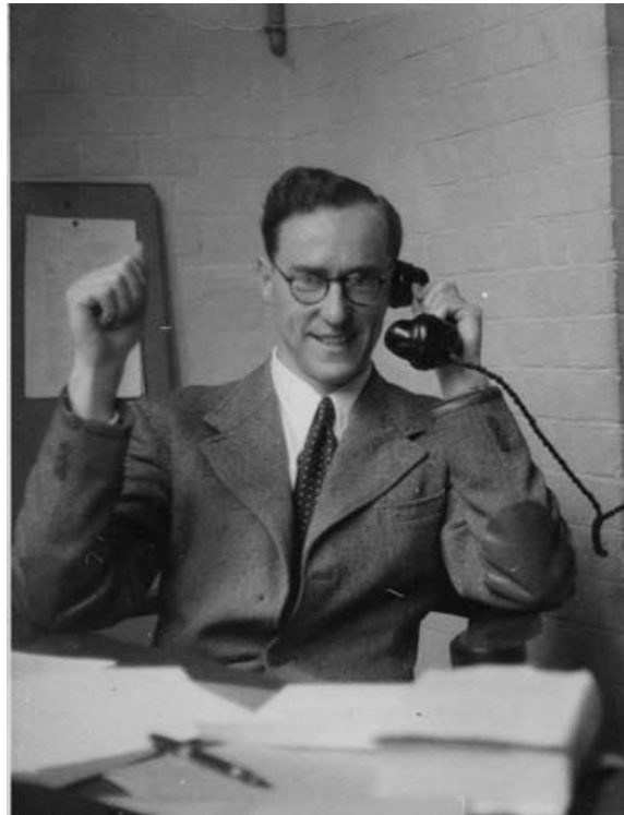
Figure 8.4 George Batchelor, having been recently elected FRS, in his office at the old Cavendish Laboratory, October 1956.