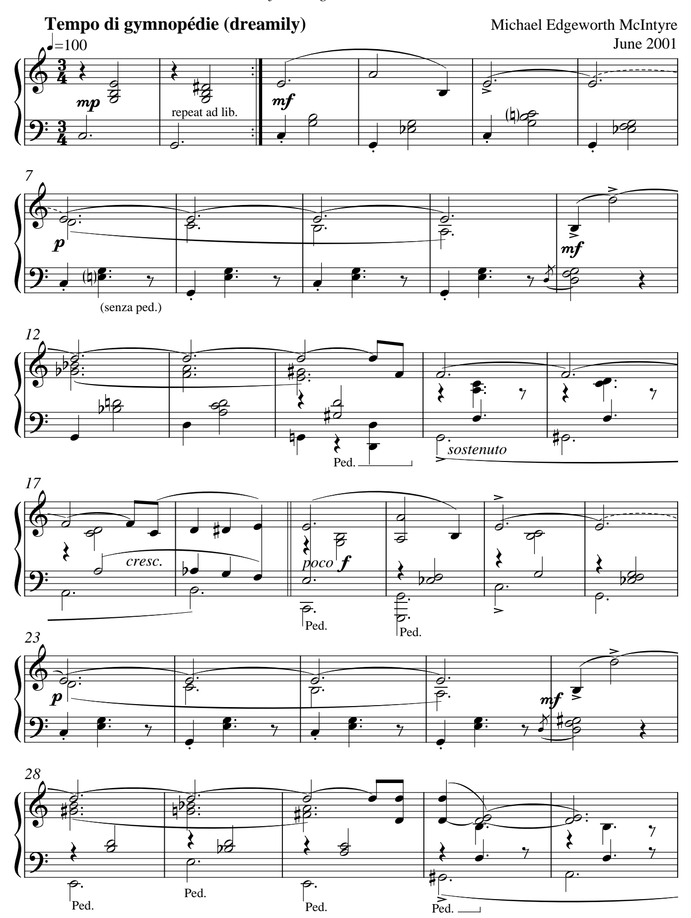
First performed, à la Victor Borge, after dinner on 25 June 2001 at the Château de Mons, Caussens, in the French Armagnac district